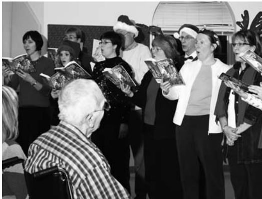
Singers from the Chorale sang for seniors at two area nursing homes in December.

All these activities are in addition to Masterworks' ongoing outreach to youth via yearly carol sharing with residents of the Lucas County Youth Treatment Center, our "artnership" with Toledo School for the Arts, and our High School Intern Program.